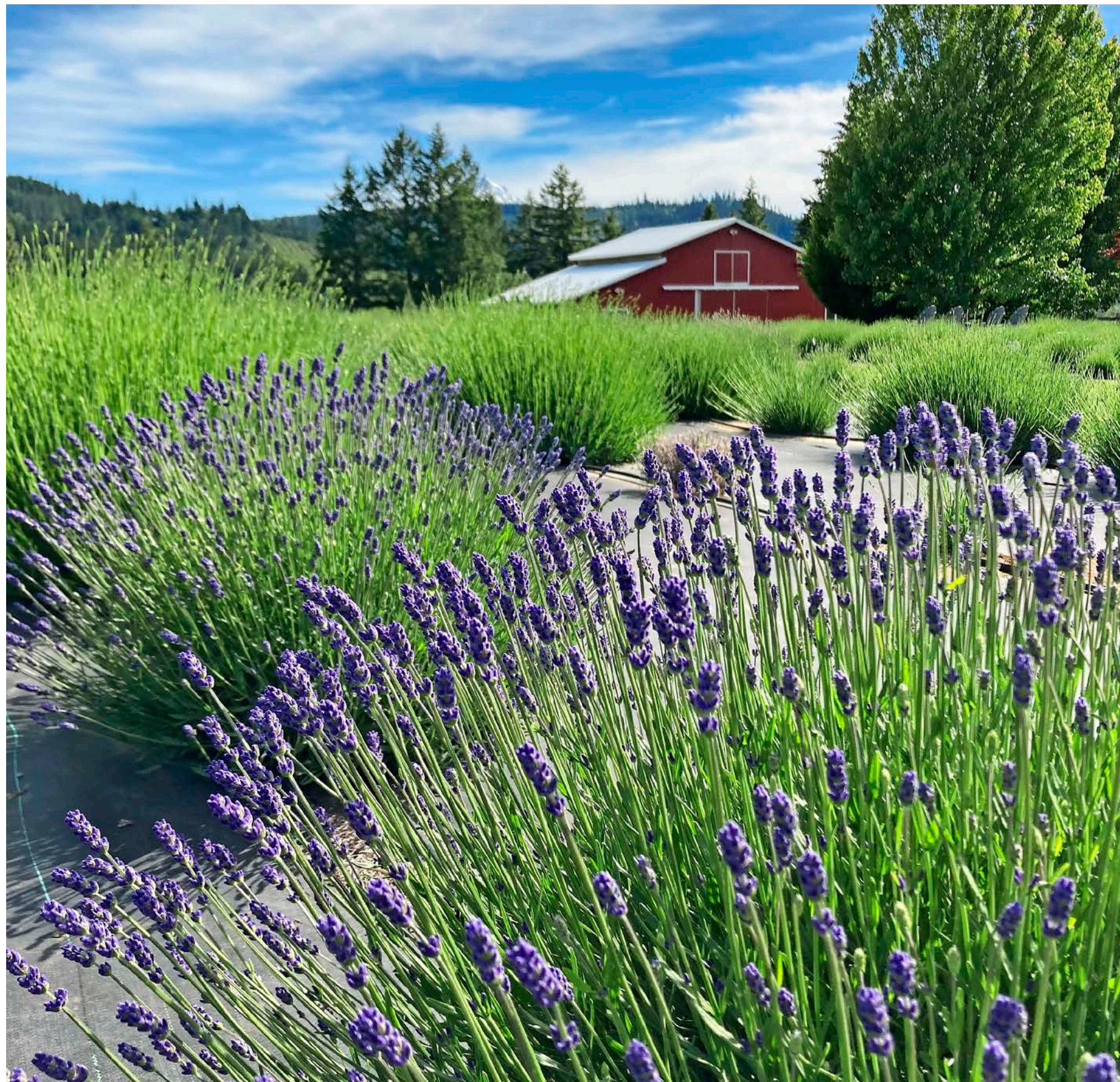
APPLE PICKING: GREG VAUGHN/ALAMY STOCK PHOTO; LAVENDER: HOOD RIVER LAVENDER FARMS

Hunt for fun and quirky vintage treasures, from repurposed art to records, at the Old Trunk, a shop inside an early 1900s general store. Pull up a stool at an old-time soda fountain that serves sodas crafted with house-made fruit syrups as well as shakes and soft serve ice cream perfect for mounding alongside fresh apple and pumpkin pies. oldtrunkhr.com