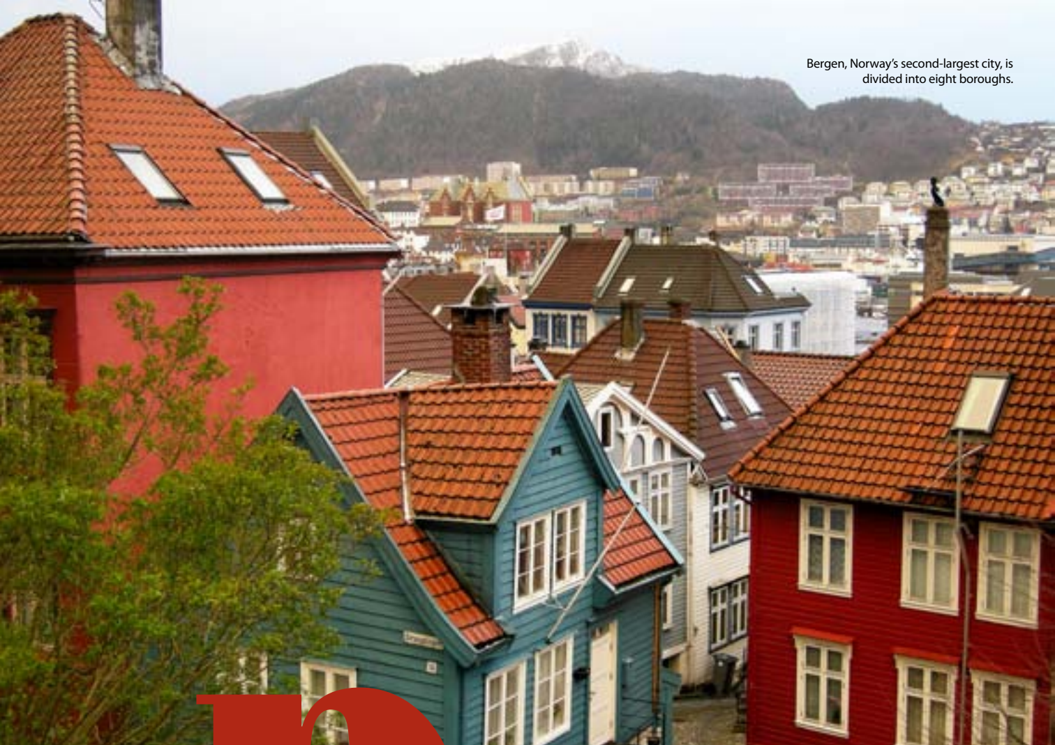
Bergen, Norway's second-largest city, is divided into eight boroughs.