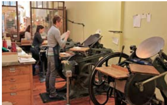
Far left: Pieces by Chinese artist Ai Weiwei are on display at the Museum of Contemporary Craft. Above and left: Oblation Papers and Press is known for its antique letterpresses and unique stationery.