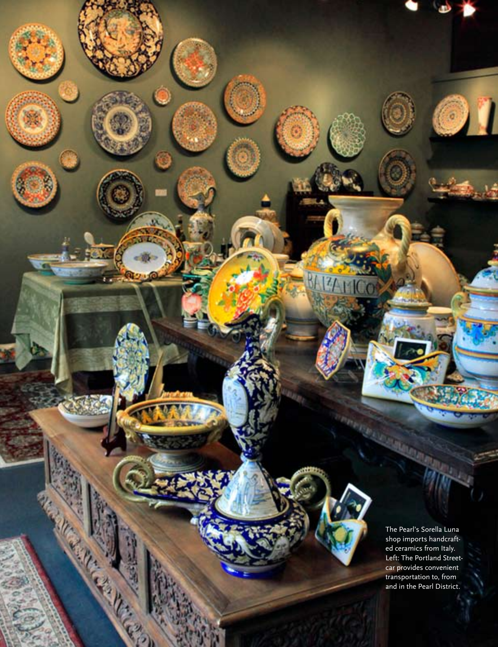
The Pearl's Sorella Luna shop imports handcrafted ceramics from Italy. Left: The Portland Streetcar provides convenient transportation to, from and in the Pearl District.